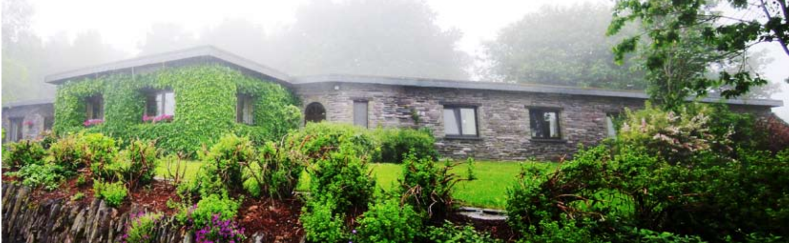
A house build with Belgian Blue Stone