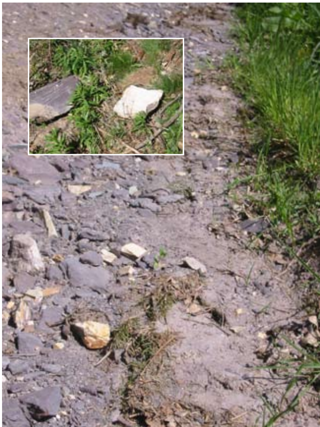
Familiar blue and yellow rocks along the way

We took a short break at a large WW II monument, constructed by a plate attached to what appeared to be an enormous piece of Blue/Yellow combo stone.