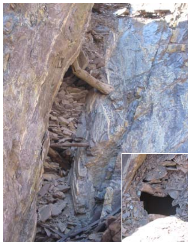
Cross-section of a former shaft, opened by Ardennes quarrying activities. The inset picture shows an opening to the lowest shaft.