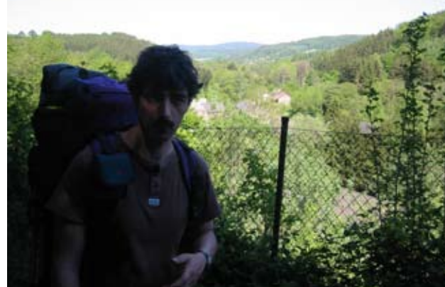
Your servant, climbing a hill in Coticule County